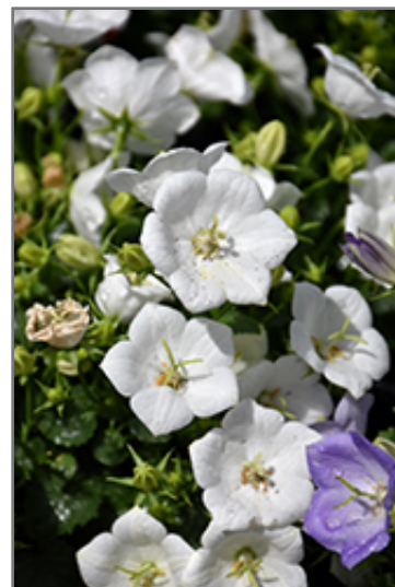
Rapido White Bellflower flowers