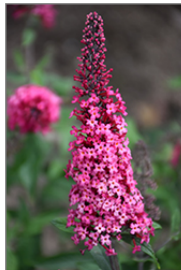
Monarch Prince Charming Butterfly Bush flowers