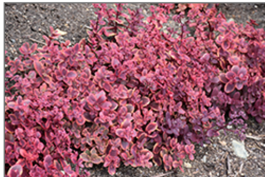
Sunsparkler Wildfire Stonecrop