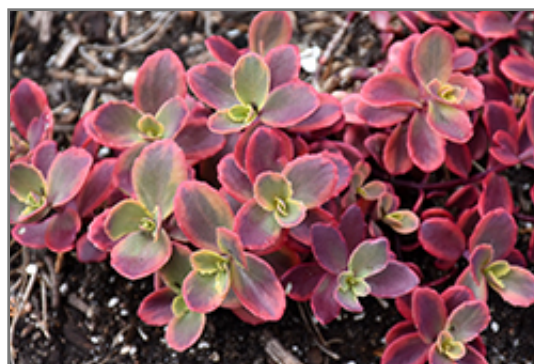
Sunsparkler Wildfire Stonecrop foliage