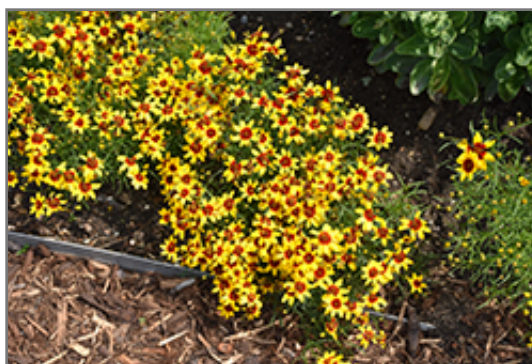
Sizzle And Spice Curry Up Tickseed in bloom