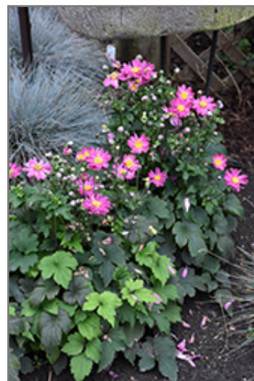
Curtain Call Deep Rose Anemone in bloom