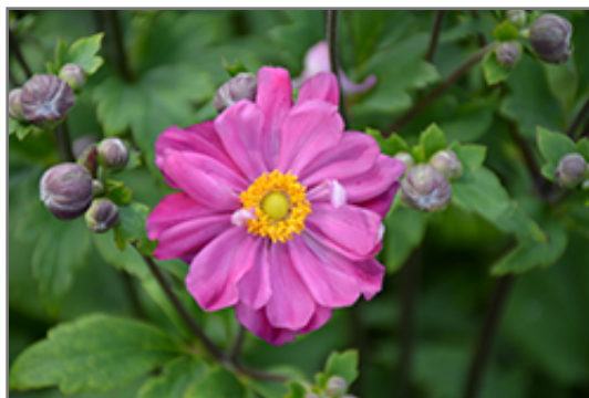
Curtain Call Deep Rose Anemone flowers

This is a relatively low maintenance plant, and is best cleaned up in early spring before it resumes active growth for the season. It is a good choice for attracting bees and butterflies to your yard. It has no significant negative characteristics.