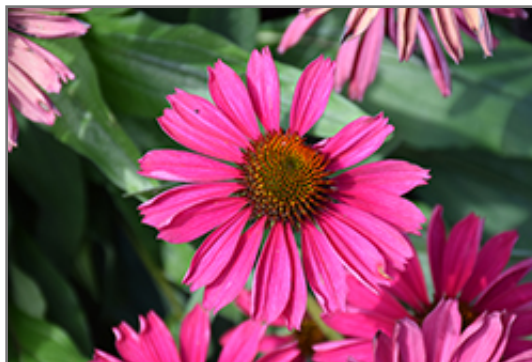
Kismet Raspberry Coneflower flowers