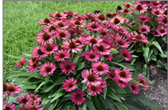
Kismet Raspberry Coneflower in bloom

Kismet Raspberry Coneflower will grow to be about 16 inches tall at maturity, with a spread of 24 inches. Its foliage tends to remain dense right to the ground, not requiring facer plants in front. It grows at a fast rate, and under ideal conditions can be expected to live for approximately 10 years. As an herbaceous perennial, this plant will usually die back to the crown each winter, and will regrow from the base each spring. Be careful not to disturb the crown in late winter when it may not be readily seen!