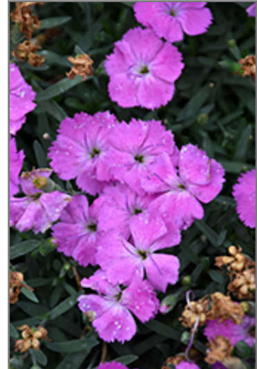
Paint The Town Fuchsia Pinks flowers

Paint The Town Fuchsia Pinks is recommended for the following landscape applications;