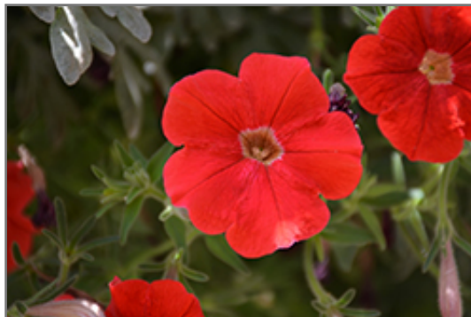
Supertunia Really Red Petunia flowers

Supertunia Really Red Petunia is recommended for the following landscape applications;