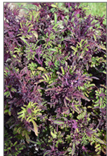
Under The Sea Lime Shrimp Coleus foliage