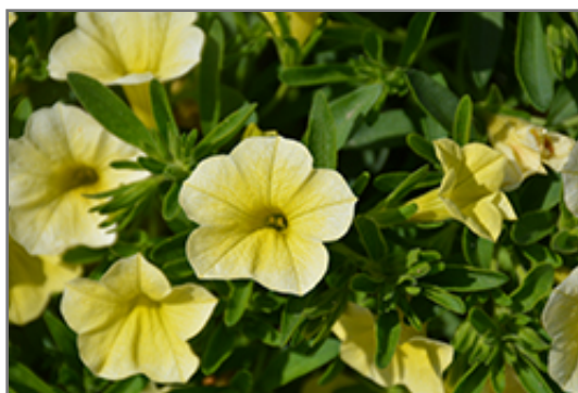
Cabaret Lemon Yellow Calibrachoa flowers