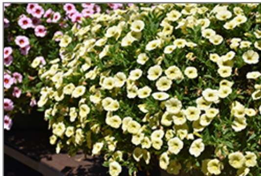
Cabaret Lemon Yellow Calibrachoa flowers

Cabaret Lemon Yellow Calibrachoa will grow to be about 10 inches tall at maturity, with a spread of 18 inches. When grown in masses or used as a bedding plant, individual plants should be spaced approximately 12 inches apart. Its foliage tends to remain low and dense right to the ground. This fast-growing annual will normally live for one full growing season, needing replacement the following year.