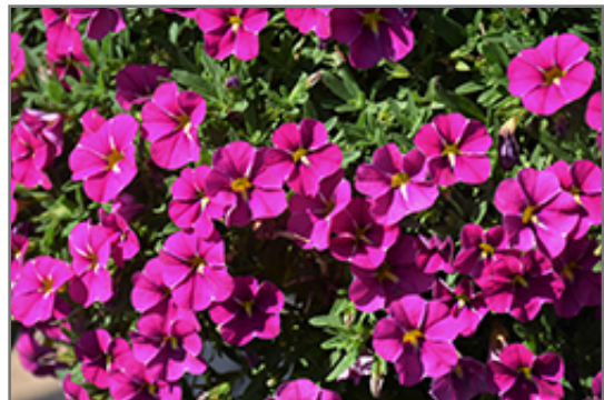
Cabaret Pink Star Calibrachoa flowers