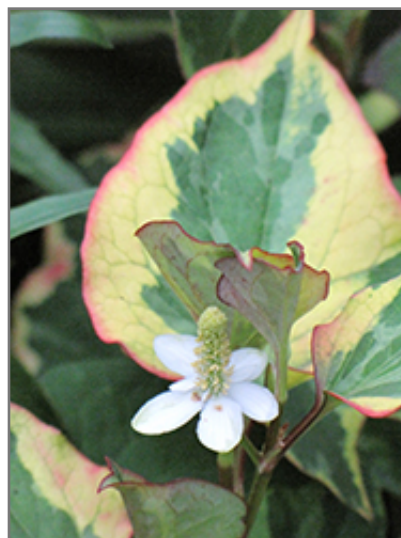
Chameleon Houttuynia flowers