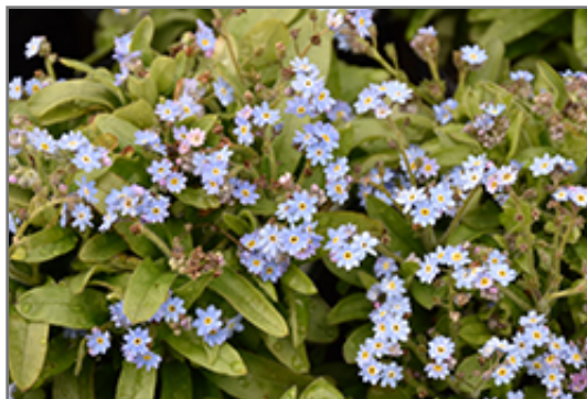
Victoria Blue Forget-Me-Not flowers