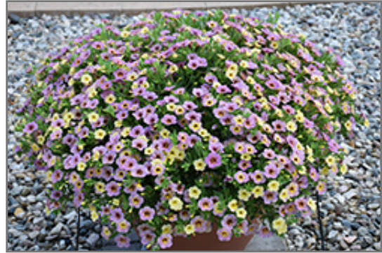
Chameleon Blueberry Scone Calibrachoa in bloom