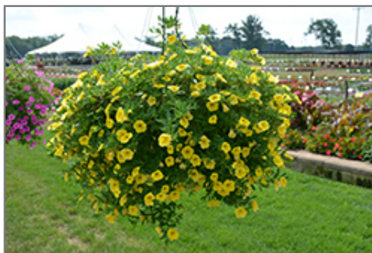
MiniFamous Neo Deep Yellow Calibrachoa in bloom