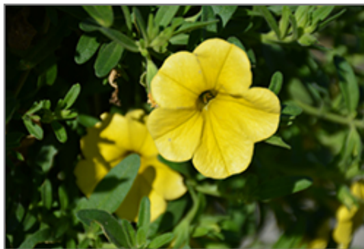
MiniFamous Neo Deep Yellow Calibrachoa flowers