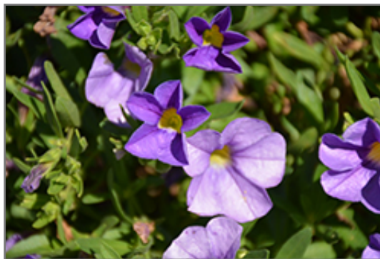
MiniFamous Neo Light Blue Calibrachoa flowers