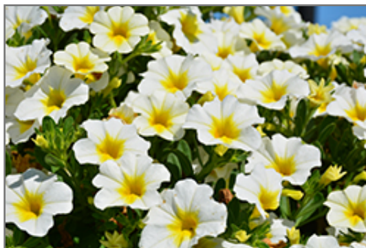
MiniFamous Neo White + Yellow Eye Calibrachoa flowers

This plant will require occasional maintenance and upkeep. Trim off the flower heads after they fade and die to encourage more blooms late into the season. It is a good choice for attracting bees and hummingbirds to your yard, but is not particularly attractive to deer who tend to leave it alone in favor of tastier treats. It has no significant negative characteristics.