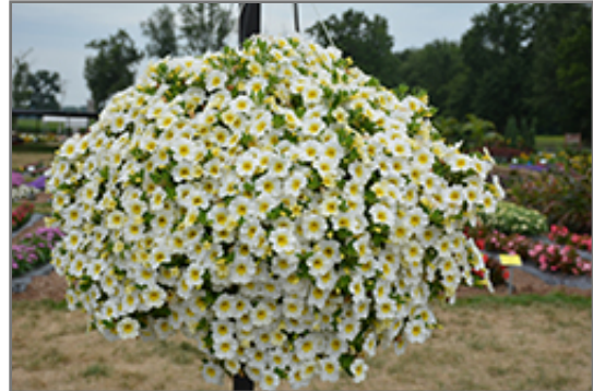
MiniFamous Neo White + Yellow Eye Calibrachoa in bloom

MiniFamous Neo White + Yellow Eye Calibrachoa is a fine choice for the garden, but it is also a good selection for planting in outdoor containers and hanging baskets. Because of its trailing habit of growth, it is ideally suited for use as a 'spiller' in the 'spiller-thriller-filler' container combination; plant it near the edges where it can spill gracefully over the pot. Note that when growing plants in outdoor containers and baskets, they may require more frequent waterings than they would in the yard or garden.