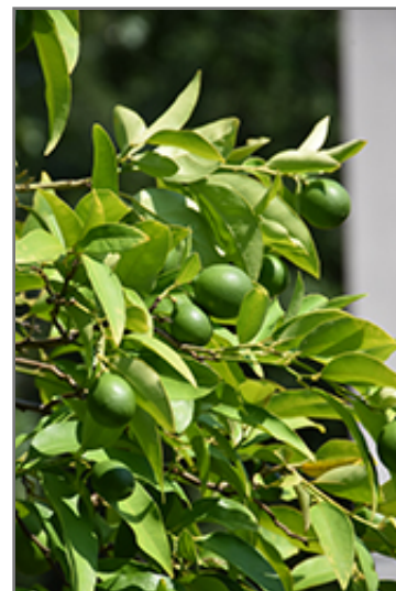
Key Lime fruit

Key Lime is a good choice for the edible garden, but it is also well-suited for use in outdoor pots and containers. Its large size and upright habit of growth lend it for use as a solitary accent, or in a composition surrounded by smaller plants around the base and those that spill over the edges. It is even sizeable enough that it can be grown alone in a suitable container. Note that when grown in a container, it may not perform exactly as indicated on the tag - this is to be expected. Also note that when growing plants in outdoor containers and baskets, they may require more frequent waterings than they would in the yard or garden. Be aware that in our climate, this plant may be too tender to survive the winter if left outdoors in a container. Contact our experts for more information on how to protect it over the winter months.