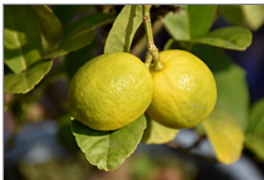
Key Lime fruit