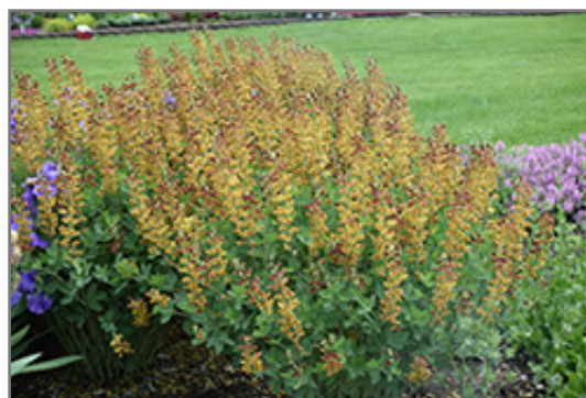
Decadence Cherries Jubilee False Indigo in bloom