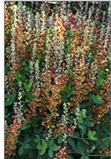
Decadence Cherries Jubilee False Indigo flowers

* This is a 'special order' plant - contact store for details