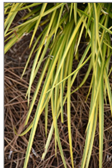
EverColor Everoro Japanese Sedge foliage