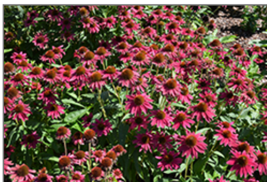
Sombrero Tres Amigos Coneflower in bloom