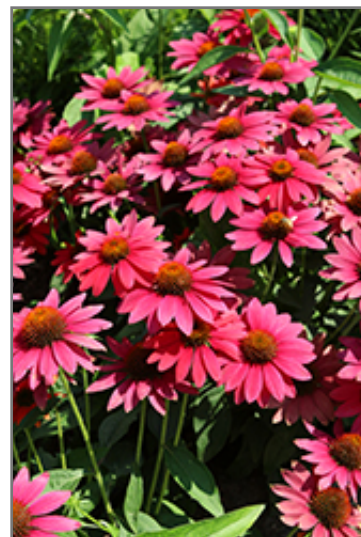
Sombrero Tres Amigos Coneflower flowers

Sombrero Tres Amigos Coneflower is recommended for the following landscape applications;