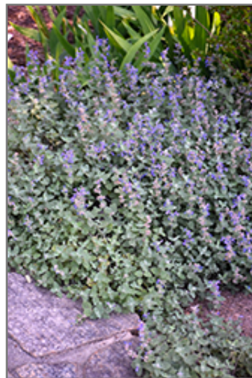
Early Bird Catmint in bloom