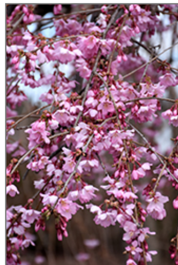
Pink Cascade Weeping Cherry flowers