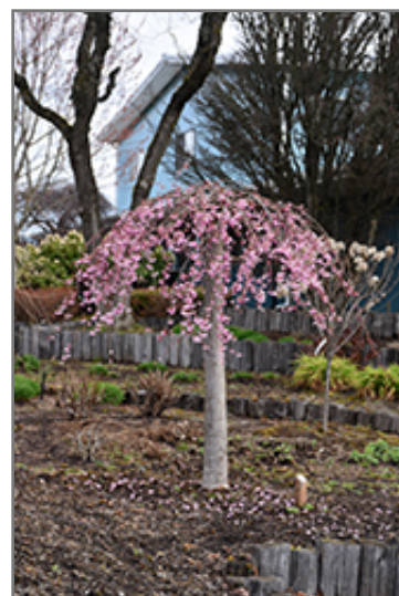
Pink Cascade Weeping Cherry in bloom