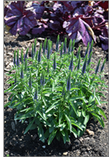
Magic Show Wizard of Ahhs Speedwell in bloom

* This is a 'special order' plant - contact store for details