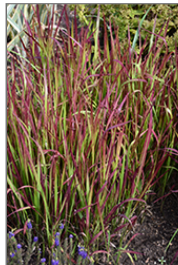
Red Baron Japanese Blood Grass foliage

Red Baron Japanese Blood Grass is recommended for the following landscape applications;