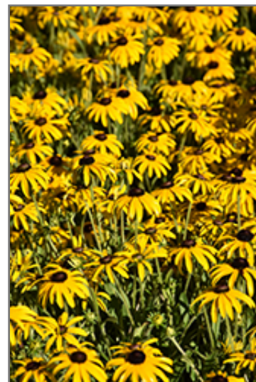
American Gold Rush Coneflower flowers

American Gold Rush Coneflower is a fine choice for the garden, but it is also a good selection for planting in outdoor pots and containers. With its upright habit of growth, it is best suited for use as a 'thriller' in the 'spiller-thriller-filler' container combination; plant it near the center of the pot, surrounded by smaller plants and those that spill over the edges. Note that when growing plants in outdoor containers and baskets, they may require more frequent waterings than they would in the yard or garden.