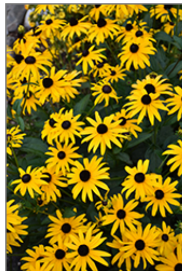
American Gold Rush Coneflower flowers

American Gold Rush Coneflower is recommended for the following landscape applications;