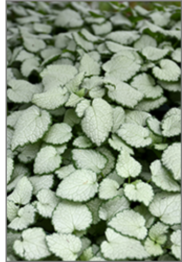
Red Nancy Spotted Dead Nettle foliage

* This is a 'special order' plant - contact store for details