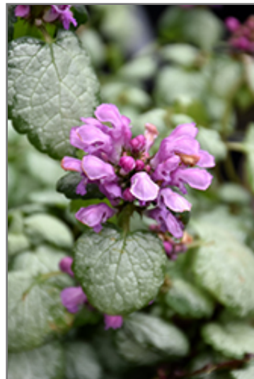
Red Nancy Spotted Dead Nettle flowers