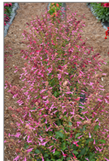
Skyscraper Pink Salvia in bloom

Skyscraper Pink Salvia is a fine choice for the garden, but it is also a good selection for planting in outdoor pots and containers. With its upright habit of growth, it is best suited for use as a 'thriller' in the 'spiller-thriller-filler' container combination; plant it near the center of the pot, surrounded by smaller plants and those that spill over the edges. Note that when growing plants in outdoor containers and baskets, they may require more frequent waterings than they would in the yard or garden.