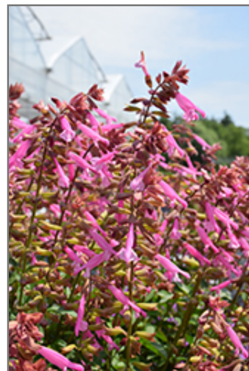
Skyscraper Pink Salvia flowers

Skyscraper Pink Salvia is an herbaceous annual with an upright spreading habit of growth. Its relatively fine texture sets it apart from other garden plants with less refined foliage.