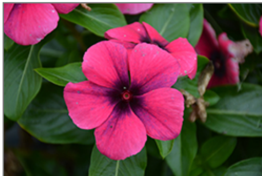
Tattoo Raspberry Vinca flowers

Tattoo Raspberry Vinca is recommended for the following landscape applications;