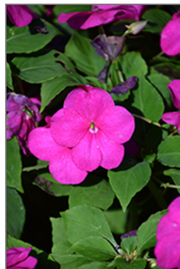
Beacon Violet Shades Impatiens flowers