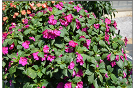
Beacon Violet Shades Impatiens in bloom

Beacon Violet Shades Impatiens will grow to be about 15 inches tall at maturity, with a spread of 12 inches. When grown in masses or used as a bedding plant, individual plants should be spaced approximately 8 inches apart. Its foliage tends to remain dense right to the ground, not requiring facer plants in front. This fast-growing annual will normally live for one full growing season, needing replacement the following year.