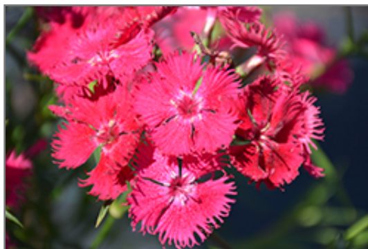
Rockin' Rose Pinks flowers

Rockin' Rose Pinks is recommended for the following landscape applications;