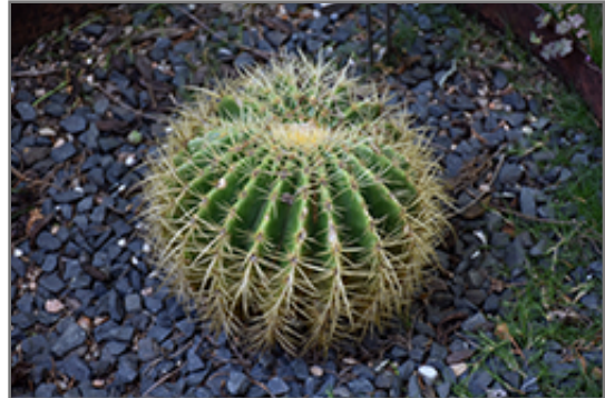
Golden Barrel Cactus

Golden Barrel Cactus is a succulent evergreen plant. It is a member of the cactus family, which are grown primarily for their characteristic shapes, their interesting features and textures, and their high tolerance for hot, dry growing environments. Like all cacti, it doesn't actually have leaves, but rather modified succulent stems that comprise the bulk of the plant, and which are designed to hold water for long periods of time. This particular cactus is valued for its distinctive barrel shape, and usually grows as a single spiny ribbed green stem. This plant has yellow cup-shaped flowers held atop the stems from late spring to early summer, which are interesting on close inspection.