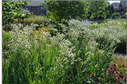
Rattlesnake Master in bloom

Rattlesnake Master is a fine choice for the garden, but it is also a good selection for planting in outdoor pots and containers. Because of its height, it is often used as a 'thriller' in the 'spiller-thriller-filler' container combination; plant it near the center of the pot, surrounded by smaller plants and those that spill over the edges. It is even sizeable enough that it can be grown alone in a suitable container. Note that when growing plants in outdoor containers and baskets, they may require more frequent waterings than they would in the yard or garden.