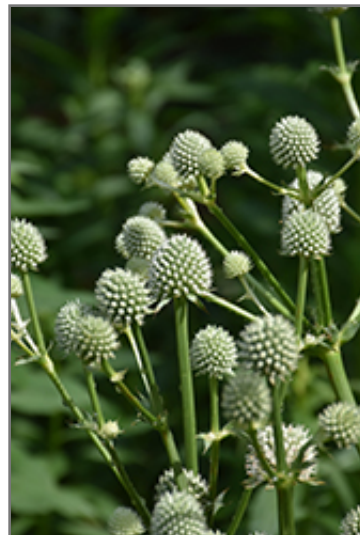
Rattlesnake Master flowers