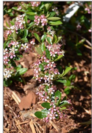
Ground Hug Aronia flowers