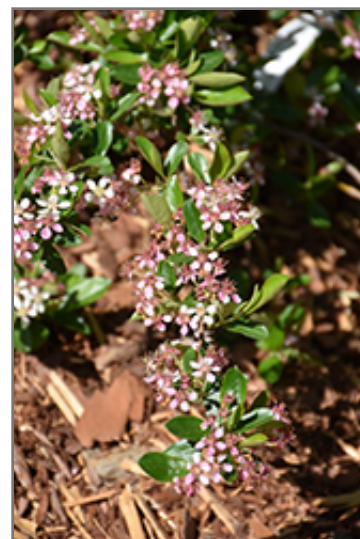
Ground Hug Aronia flowers