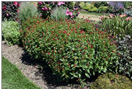
Little Redhead Indian Pink in bloom

Little Redhead Indian Pink is a fine choice for the garden, but it is also a good selection for planting in outdoor pots and containers. With its upright habit of growth, it is best suited for use as a 'thriller' in the 'spiller-thriller-filler' container combination; plant it near the center of the pot, surrounded by smaller plants and those that spill over the edges. Note that when growing plants in outdoor containers and baskets, they may require more frequent waterings than they would in the yard or garden.