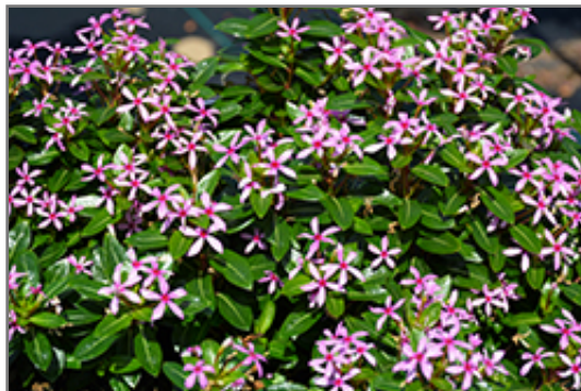
Soiree Kawaii Light Purple Vinca flowers

Soiree Kawaii Light Purple Vinca is recommended for the following landscape applications;