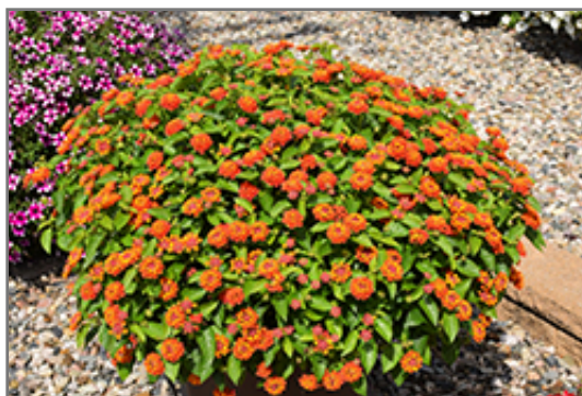
Hot Blooded Red Lantana in bloom