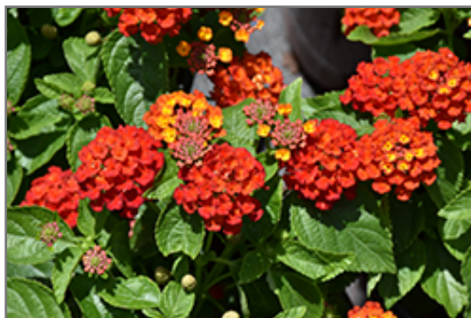
Hot Blooded Red Lantana flowers

Hot Blooded Red Lantana is recommended for the following landscape applications;