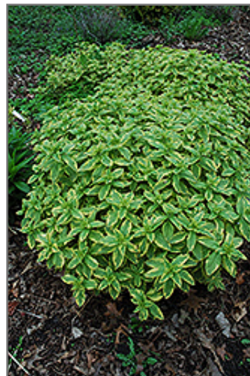
Golden Alexander Loosestrife