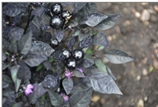
Onyx Red Ornamental Pepper fruit

Onyx Red Ornamental Pepper is an herbaceous annual with an upright spreading habit of growth. Its medium texture blends into the garden, but can always be balanced by a couple of finer or coarser plants for an effective composition.