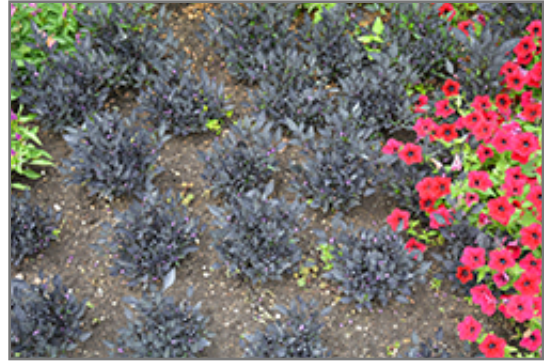
Onyx Red Ornamental Pepper

Onyx Red Ornamental Pepper is a fine choice for the garden, but it is also a good selection for planting in outdoor containers and hanging baskets. It is often used as a 'filler' in the 'spiller-thriller-filler' container combination, providing a mass of flowers against which the larger thriller plants stand out. Note that when growing plants in outdoor containers and baskets, they may require more frequent waterings than they would in the yard or garden.