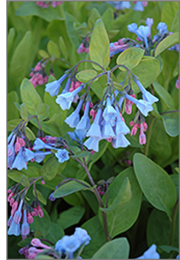
Virginia Bluebells flowers

Virginia Bluebells will grow to be about 18 inches tall at maturity, with a spread of 18 inches. Its foliage tends to remain dense right to the ground, not requiring facer plants in front. It grows at a medium rate, and under ideal conditions can be expected to live for approximately 5 years. As an herbaceous perennial, this plant will usually die back to the crown each winter, and will regrow from the base each spring. Be careful not to disturb the crown in late winter when it may not be readily seen! As this plant tends to go dormant in summer, it is best interplanted with late-season bloomers to hide the dying foliage.