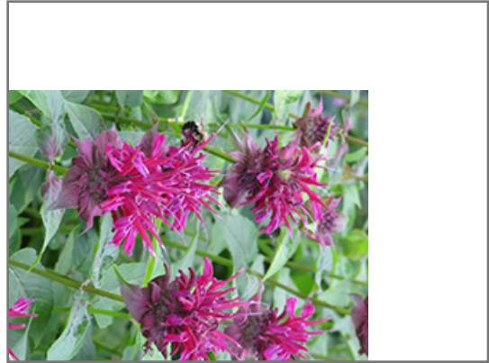
Raspberry Wine Beebalm flowers

This plant does best in full sun to partial shade. It is very adaptable to both dry and moist locations, and should do just fine under typical garden conditions. It is not particular as to soil type or pH. It is highly tolerant of urban pollution and will even thrive in inner city environments. This particular variety is an interspecific hybrid. It can be propagated by division; however, as a cultivated variety, be aware that it may be subject to certain restrictions or prohibitions on propagation.