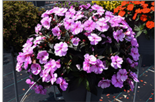
SunPatiens Vigorous Lavender Splash New Guinea Impatiens in bloom

SunPatiens Vigorous Lavender Splash New Guinea Impatiens is a fine choice for the garden, but it is also a good selection for planting in outdoor containers and hanging baskets. Because of its height, it is often used as a 'thriller' in the 'spiller-thriller-filler' container combination; plant it near the center of the pot, surrounded by smaller plants and those that spill over the edges. It is even sizeable enough that it can be grown alone in a suitable container. Note that when growing plants in outdoor containers and baskets, they may require more frequent waterings than they would in the yard or garden.