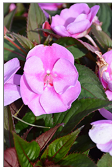
SunPatiens Vigorous Lavender Splash New Guinea Impatiens flowers