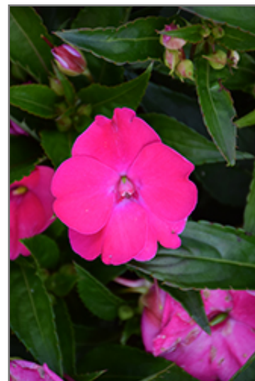
SunPatiens Vigorous Rose Pink New Guinea Impatiens flowers

SunPatiens Vigorous Rose Pink New Guinea Impatiens is recommended for the following landscape applications;