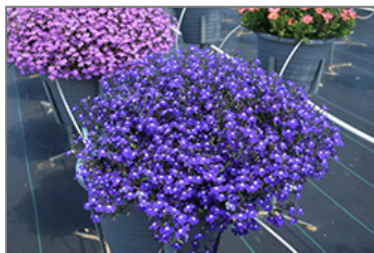
Techno Upright Cobalt Blue Lobelia in bloom