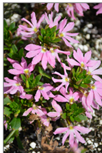
Surdiva Classic Pink Fan Flower flowers