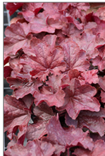
Northern Exposure Red Coral Bells foliage