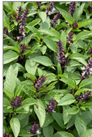
Sweet Basil flowers

Sweet Basil is a good choice for the edible garden, but it is also well-suited for use in outdoor pots and containers. It is often used as a 'filler' in the 'spiller-thriller-filler' container combination, providing the canvas against which the larger thriller plants stand out. Note that when growing plants in outdoor containers and baskets, they may require more frequent waterings than they would in the yard or garden.