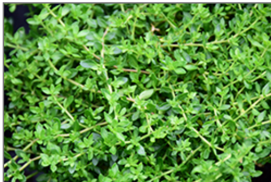
Rupturewort foliage

Rupturewort is recommended for the following landscape applications;