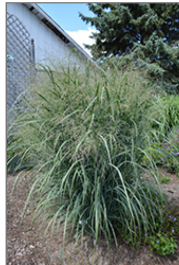
Northwind Switch Grass in bloom

This plant does best in full sun to partial shade. It is very adaptable to both dry and moist locations, and should do just fine under typical garden conditions. It is considered to be drought-tolerant, and thus makes an ideal choice for a low-water garden or xeriscape application. It is not particular as to soil type, but has a definite preference for alkaline soils, and is able to handle environmental salt. It is somewhat tolerant of urban pollution. This is a selection of a native North American species. It can be propagated by division; however, as a cultivated variety, be aware that it may be subject to certain restrictions or prohibitions on propagation.