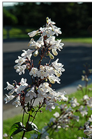
Husker Red Beard Tongue flowers