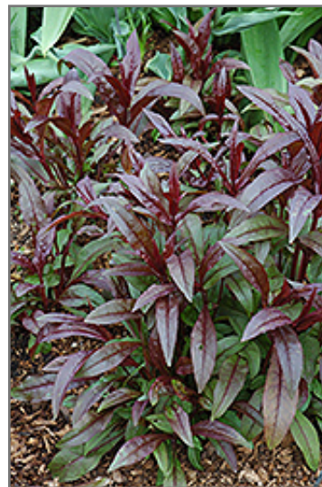
Husker Red Beard Tongue foliage